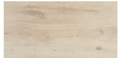
Mercia Oak DERWENT040