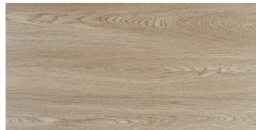
Mersey Oak DERWENT020