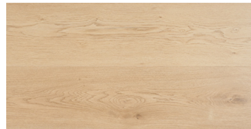
Gisburn Oak DERWENT030