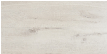
Kielder Oak DERWENT050