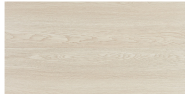
Mortimer Oak DERWENT060