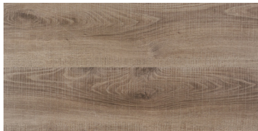
Delamere Oak DERWENT010