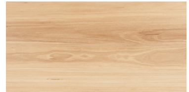
Marron Blackbutt DERWENT080