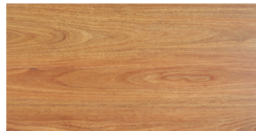
Bowen Spotted Gum DERWENT100

Abode has been tested and certified to comply with strict indoor quality emission requirements.