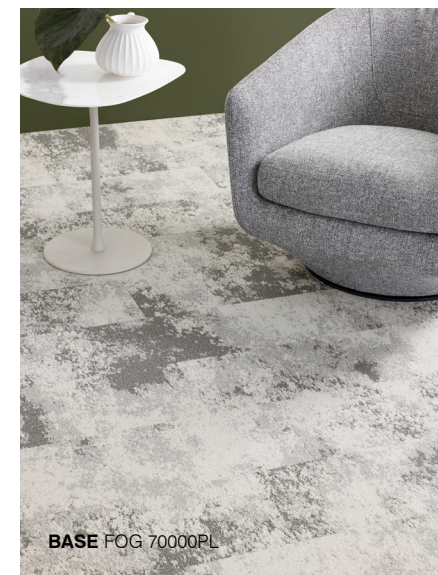
BASE FOG 70000PL