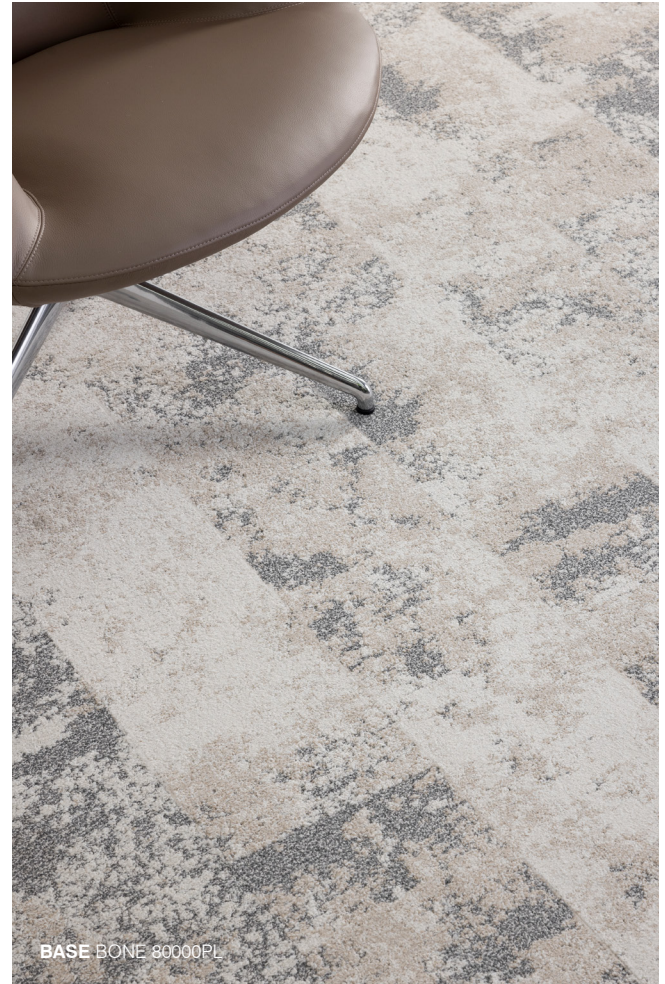
Cover: BASE BONE 80000PL

Our manufacturing process ensures no two planks are the same. Please note that there may be batch variations from different dye lots.