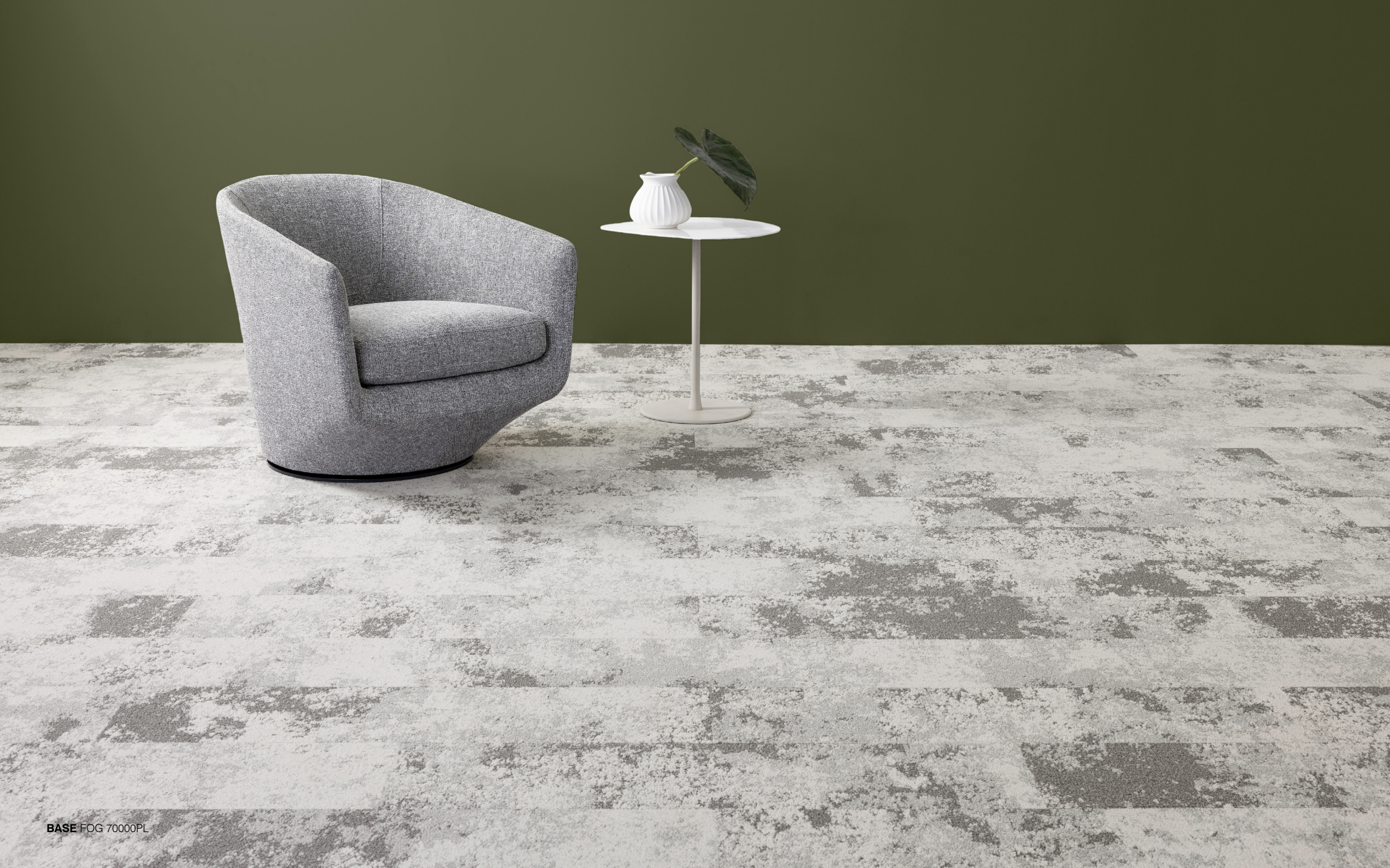
BASE FOG 70000PL