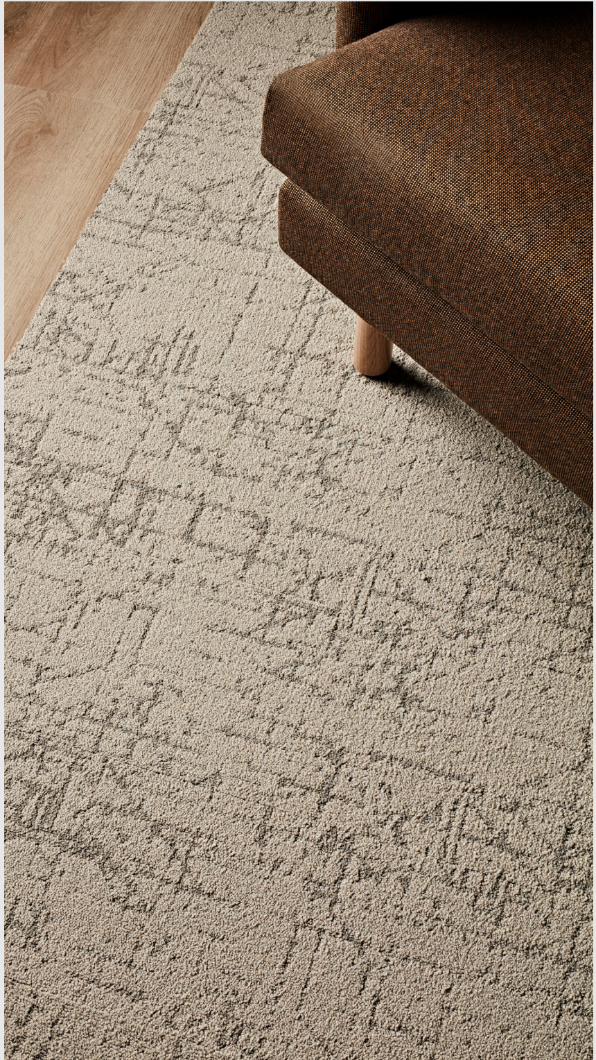
FACET RAY 7-000-000PL, 88 PLANKS WOODS URBAN OAK WOO200603ST50

au 1800 150 554 nz 0800 150 555 signaturefloors.com.au signaturefloors.co.nz