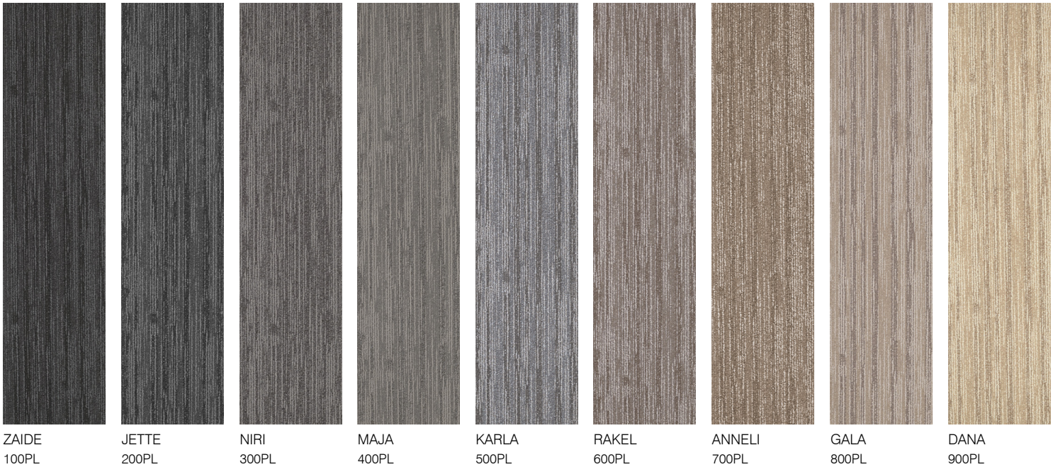
ZAIDE 100PL JETTE 200PL NIRI 300PL MAJA 400PL KARLA 500PL RAKEL 600PL ANNELI 700PL GALA 800PL DANA 900PL