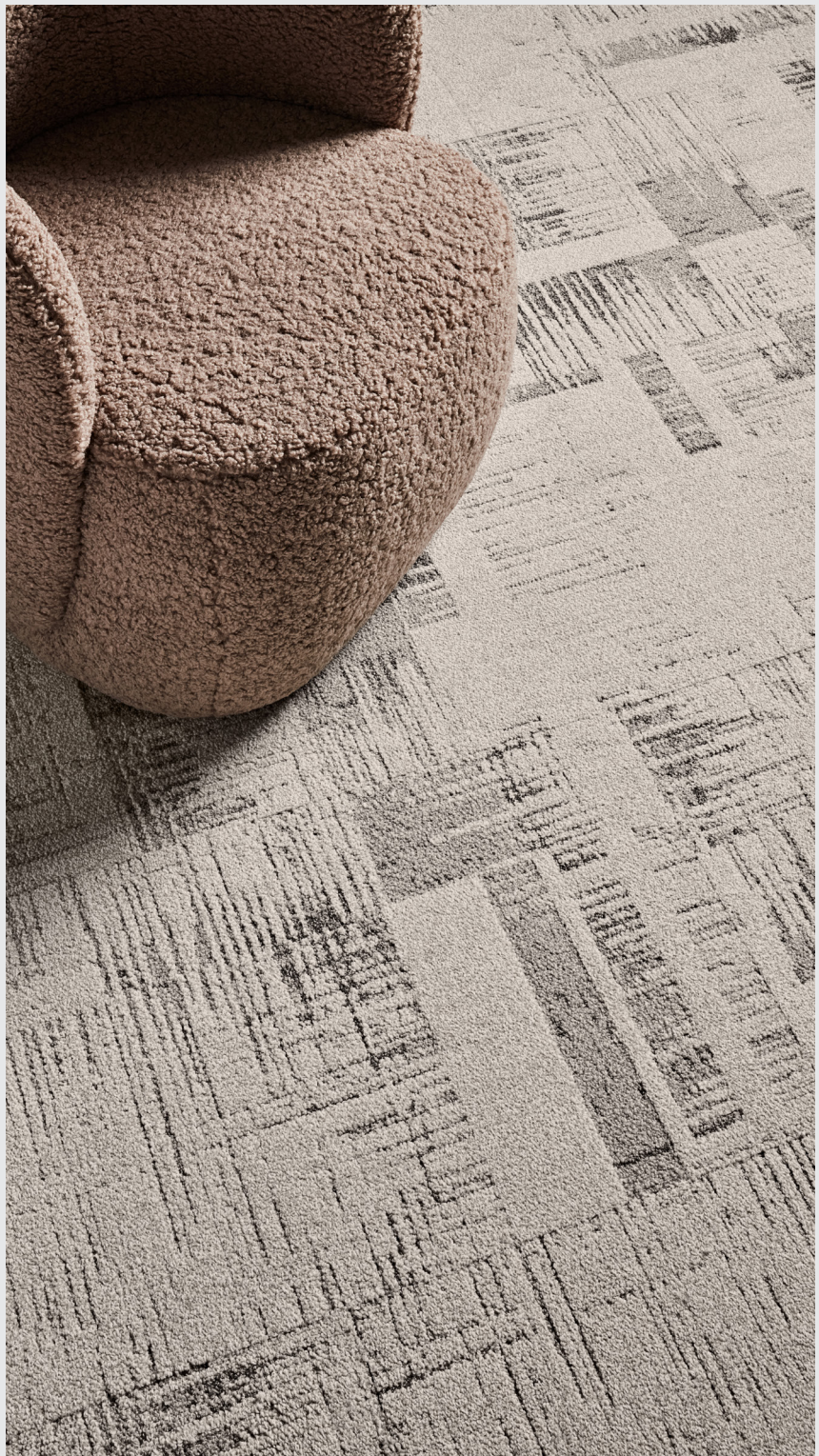
ENGRAVE LINOCUT 802WPCB

au 1800 150 554 nz 0800 150 555 signaturefloors.com.au signaturefloors.co.nz