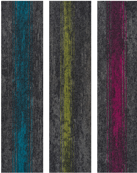
LEAD AQUA 2-021-031PL LEAD GREEN 2-048-002PL LEAD MAGENTA 2-060-062PL