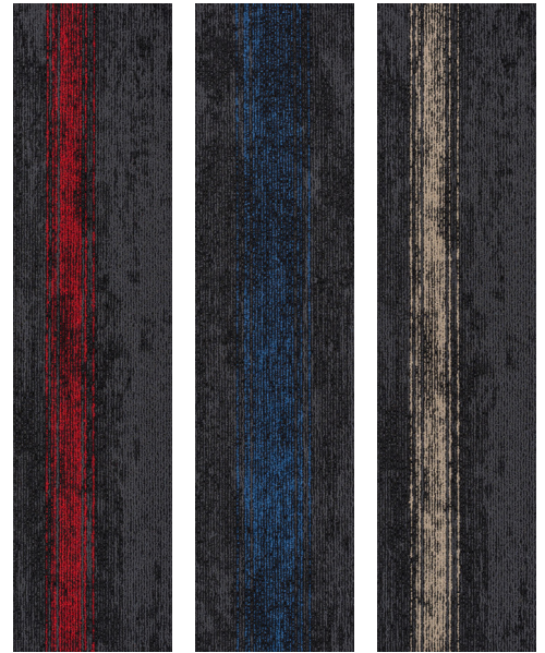
CARBON RED 1-023-035PL CARBON NAVY 1-019-040PL CARBON SAND 1-007-099PL