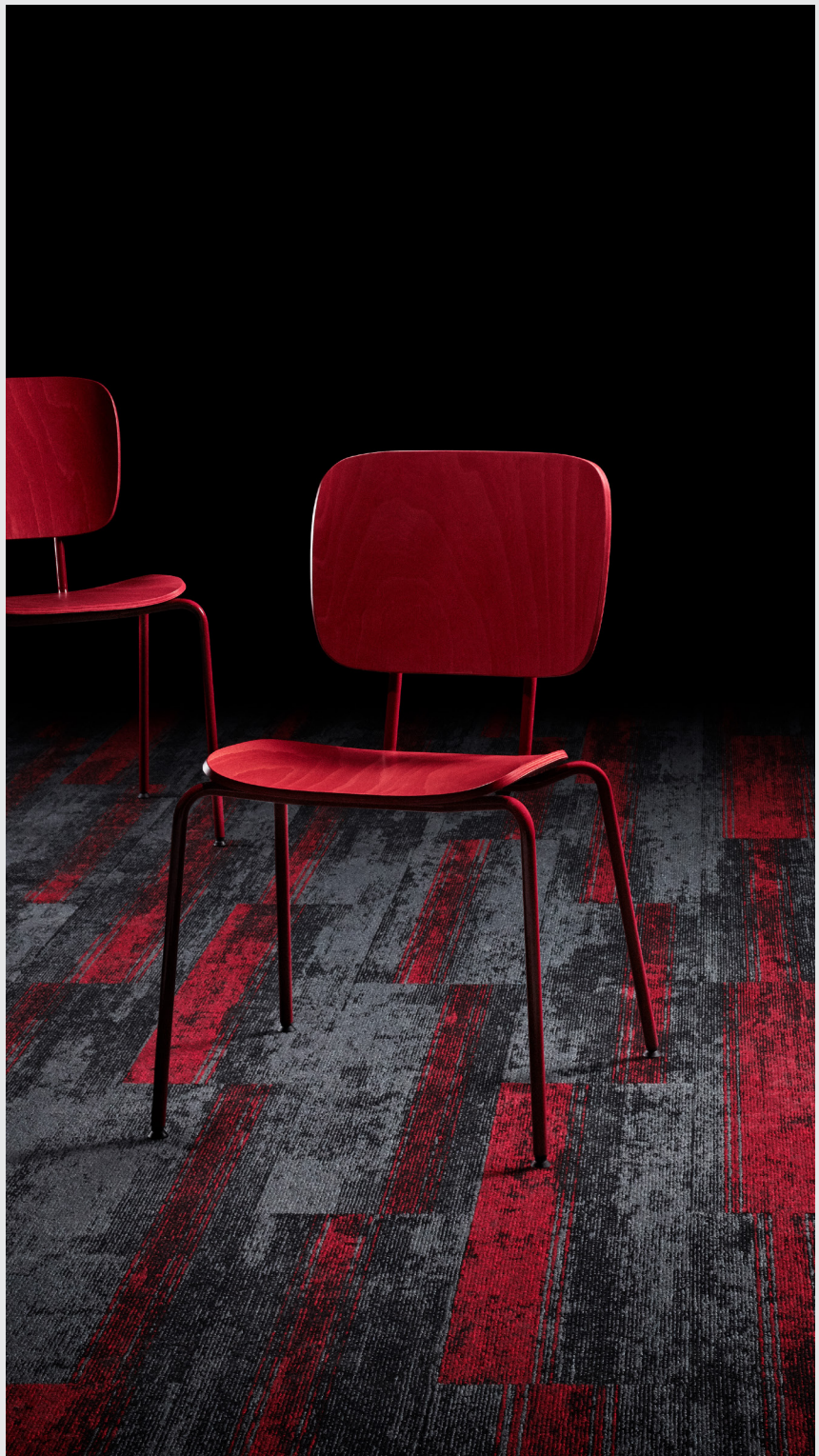
CONNECT CARBON RED 1-023-036PL

au 1800 150 554 nz 0800 150 555 signaturefloors.com.au signaturefloors.co.nz