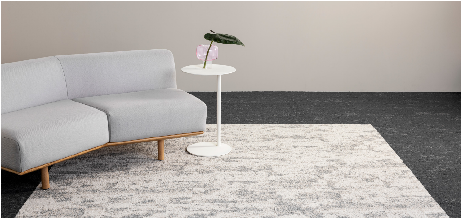
MOSS WOLF 0068PL, STONE BONE 80000PL