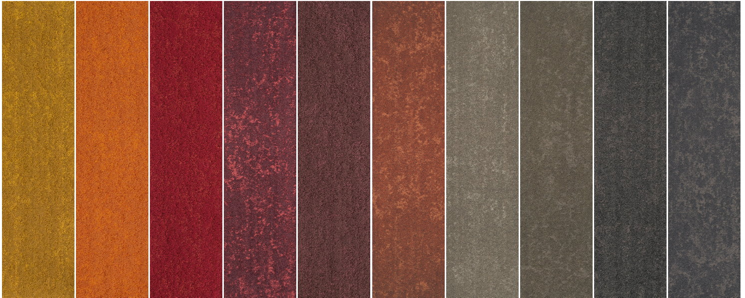
YELLOW 4282PL ORANGE 5324PL RED 3586PL MAROON 2359PL WINE 8561PL DUCK 5456PL TAN 0507PL CARAMEL 0905PL SMOKEY 7578PL WOLF 0098PL